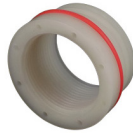
34100566 2" Male, 1.5" Female NPT Adapter