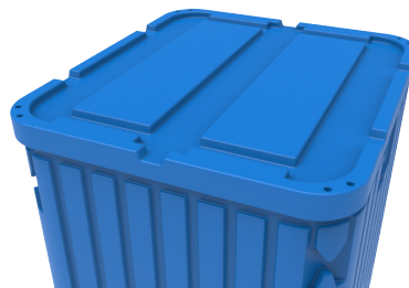
NEW Stackable Lid option available on both PB1545 & PB2145