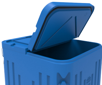
NEW Split-Lid option available on both PB1545 & PB2145