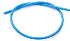
33300043 Nylon Cord