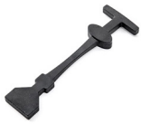
35500079 EPDM Rubber T Strap