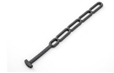
33300041 EPDM Rubber Strap