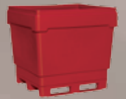
MONSTER COMBO® BINS

A sanitary fill each and every time with low cost, 2-ply pillow or form-fitting liners that are both dairy and kosher approved.