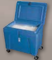
DRY ICE CONTAINERS