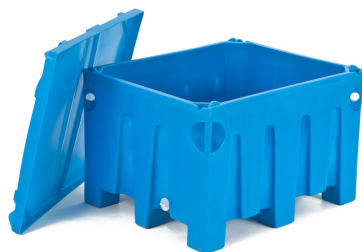
Shown with Optional Lid & Drain