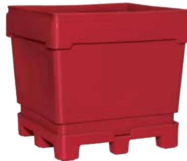
MB 2936 4-Way Socket Base