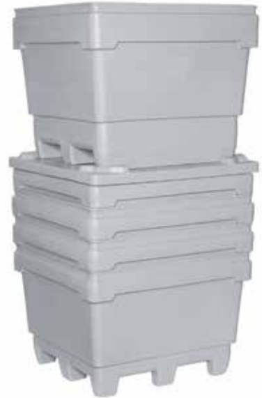
MB 2833 2-Way Stacked with Lid