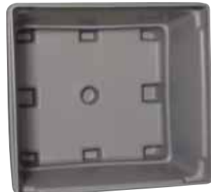
MB 2700 Inside View 4-Way