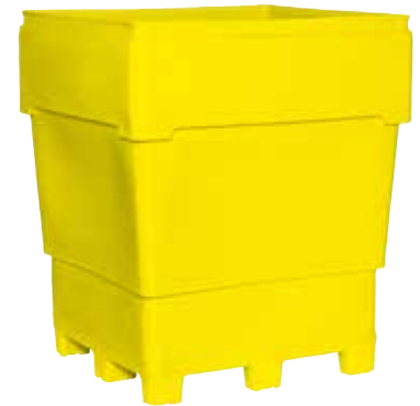
MB 2900 Welded Base