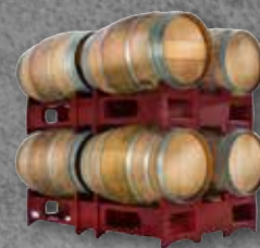
RACK-MASTER™ BARREL RACKS