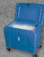
DRY ICE CONTAINERS