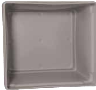
MB 2900 Inside view