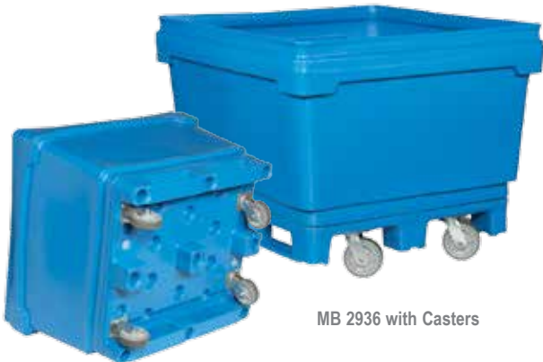
MB 2936 with Casters