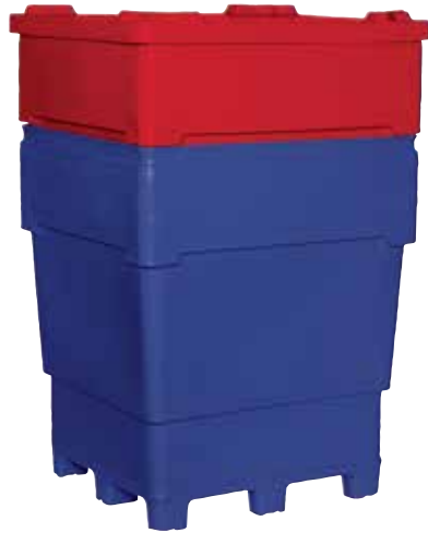
2956 4-Way Welded Base

Welded and sealed base. Spin welds seal base from water. No exposed hardware.