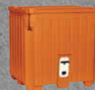
BAG IN THE BOX