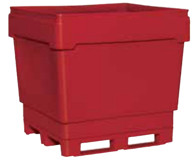
MB 2936 Roll Over Base

NOTE: Unless specified, all weights relate to box only. Dimensions and weights are +/- 2%. Standard colors for Bins are natural and gray. Optional colors available.