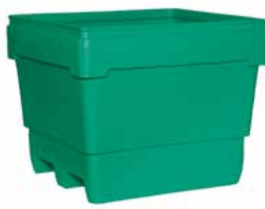
MB 2836 2-Way Molded-in Base