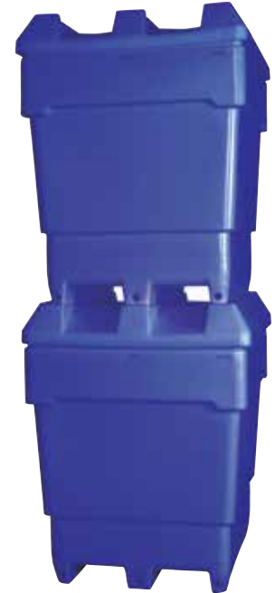
2800 Series MB with unique raised cover lid that allows for drainage and/or stacking in coolers and freezers