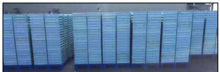
Berry Pallet II stacked with trays.