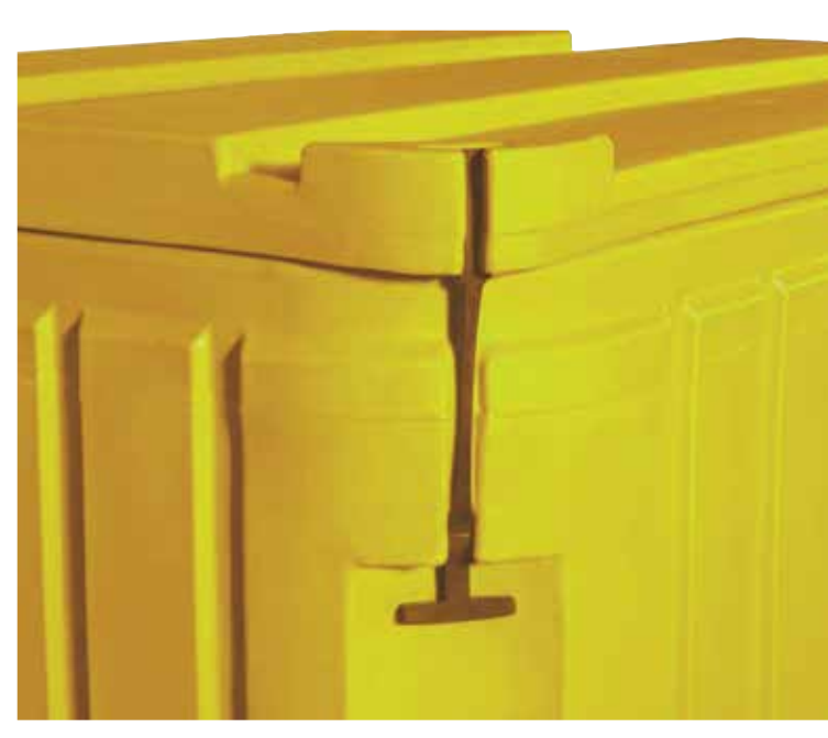
New Rubber tie downs are easy to sanitize while keeping lid in place during transport.